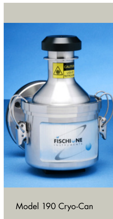
Model 190 Cryo-Can

All system components are easily accessible for service. The ion source is designed for both long component life and extended maintenance intervals. When needed, the filament can be readily replaced. Password-protected diagnostic software allows complete control over all instrument functions.